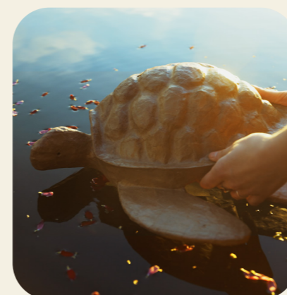
Water or garden urn